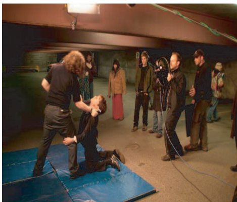
Rehearsing "The Fighter"

Available for Broadcast; Closed-Captioned; Beta SP & DigiBeta; 100% Canadian Content