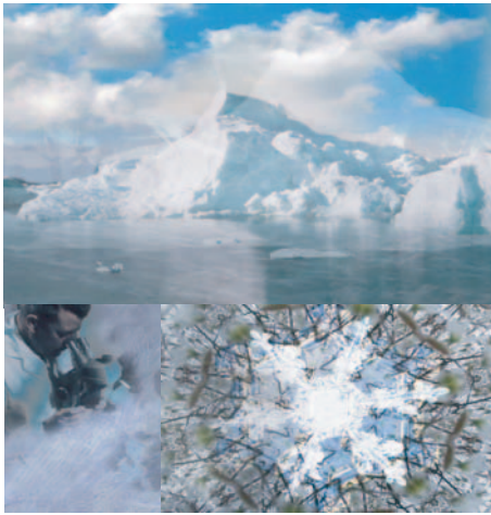
Still Frame Images by Daniel Borins & Oli Goldsmith

Available for Broadcast; Closed-Captioned; Beta SP & DigiBeta; 100% Canadian Content