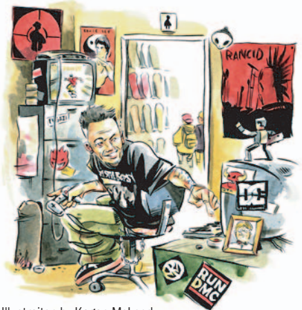
Illustration by Kagan McLeod

Available for Broadcast; Closed-Captioned; Beta SP & DigiBeta; 100% Canadian Content