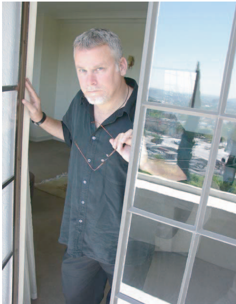
Michael Connelly

Available for Broadcast; Closed-Captioned; Beta SP & DigiBeta; 100% Canadian Content