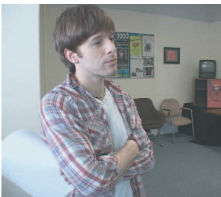
Actor Mark Power in casting call for The Fighter

Published by Little, Brown USA; Distributed in Canada by H.B. Fenn With the support of Canadian Heritage; International Festivals of Authors Media provided Courtesy of Little, Brown USA Film Copyright © 2006 by Terrill Lee Lankford